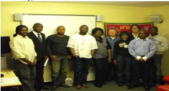
WAD Members Tameside (2011)

Our aim is to try and stop this and bring these communities together to better understand one another and integrate themselves properly into the society, allowing them the chance to better communications with the local communities, involving themselves with social activities and trends with out the need to cast aside their own identity/values in order to fit in.