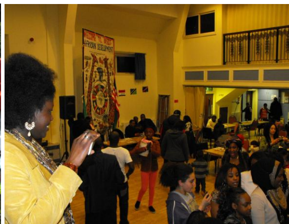
WAD Women Day event Manchester (2013)