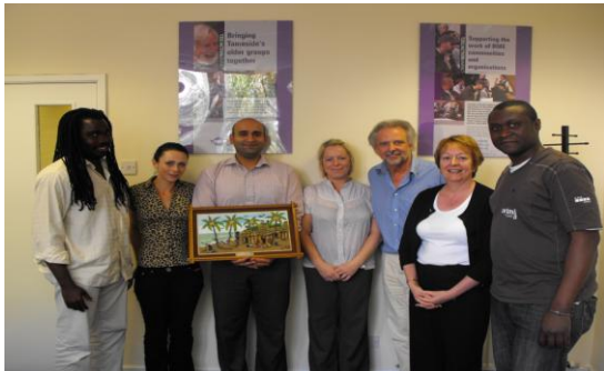
WAD thanks giving to T3SC Tameside (2008)