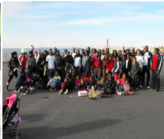
WAD Trip to Blackpool (2012)