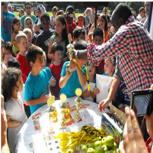
WAD Sport event Football Champions celebration