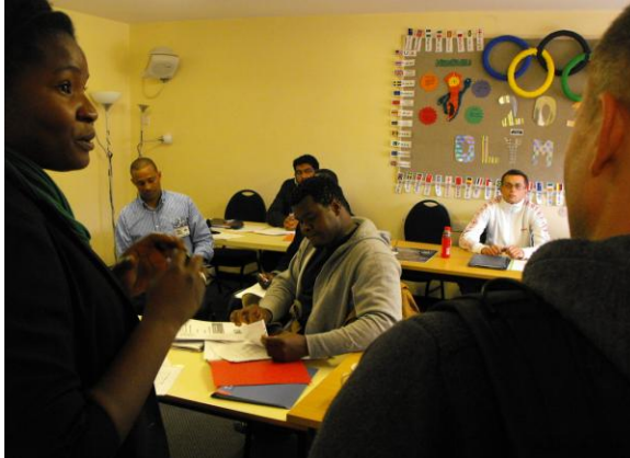
Guest speaker From T3SC at WAD training Course