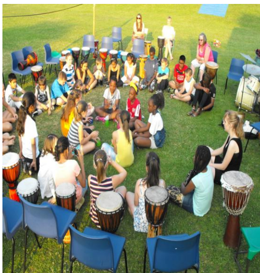
School Drumming workshop in Tameside