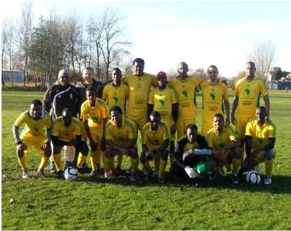
WAD football team 2013

West African Development organise football activity, started with training and move to 6 side tournament and now get promoted by interring full side the FA league.