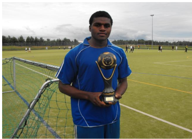
WAD team winner Tameside Tournament 2008