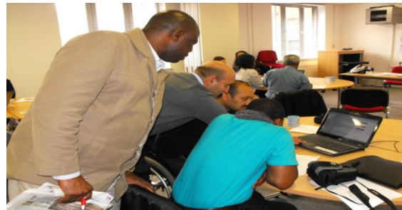
WAD Training in Bolton (2011)