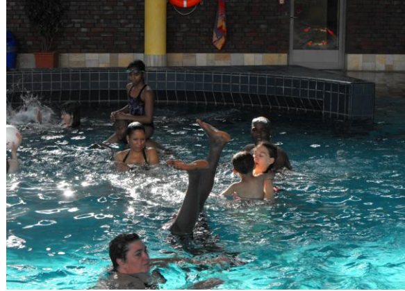
WAD swimming lesson activity