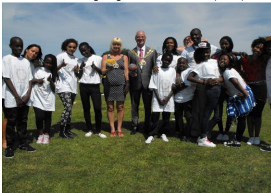
WAD team and Tameside Mayor at Denton event