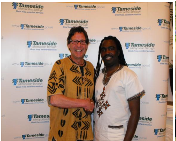
WAD at Tameside You Choose Event 2011