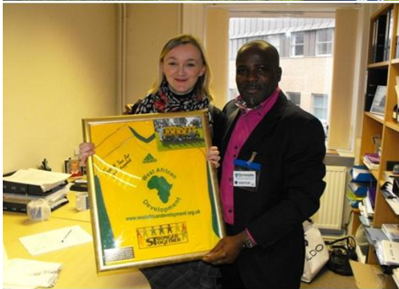
Tameside Council Support WAD football team