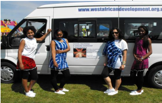
WAD Cultural Team