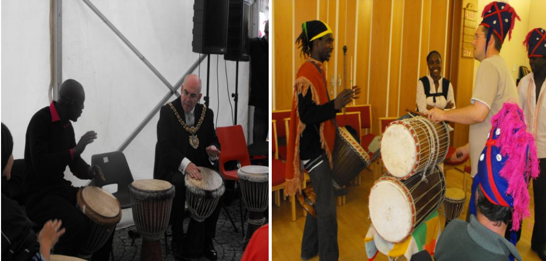
WAD and Manchester Mayor drumming workshop