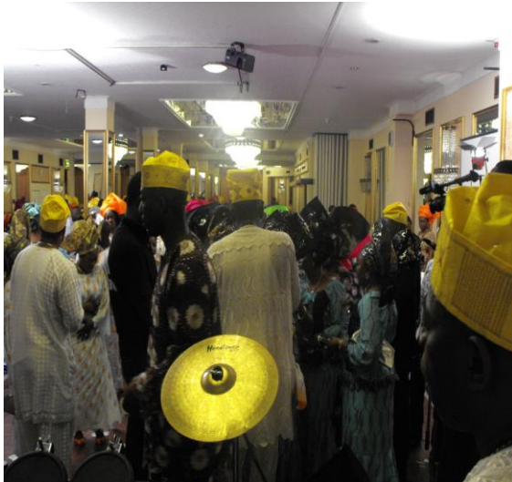
WAD Community event Manchester (2011)

In the past 6 years we have been developing WAD and have naturally grown as we have reacted to the community. The West African Development (WAD) membership and database has increased from 15 people in 2005, and 70 people in 2008, and 500+ in 2011, and up to date we have on average of over 3000 people on WAD data. We have built good relationships with other statutory and third sector organisations and agencies, and have a good reputation in our community. We have managed grants of over £25000.00 funding came from Tameside local fund and, Awards for All and public fund. We have always monitored the outcomes of our projects which have been successful and we have achieved what we set out to do. We have run our projects very cost effectively as we have very dedicated volunteers.