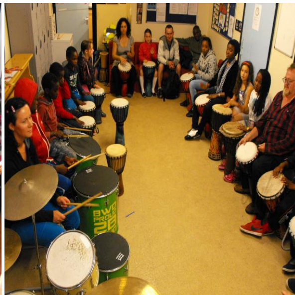
WAD drumming workshop in Manchester