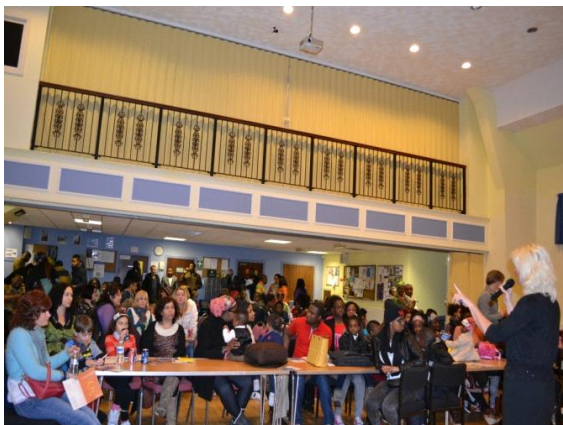
Health and Wellbeing Service