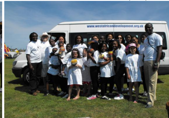
WAD at Denton (Tameside) Cultural event