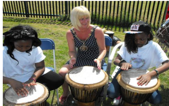
WAD Drumming workshop with Tameside Mayor