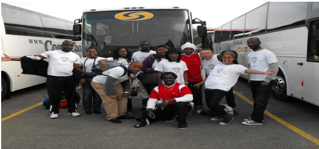
WAD Trip to Blackpool 2012

West African Development organised various trips to have a fun and learn the difference in our environment. Parent with children enjoyed a good time in Safari Park as well as our footballer enjoyed and fantastic away tournament.