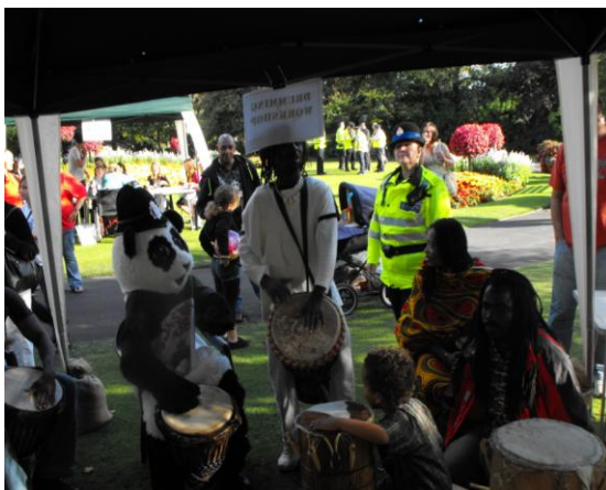
WAD drumming workshop Hyde (2007)

We aim for an almost entirely hands on approach, leaving latitude for self-development to assure and ensure the collective progression of both the minority groups and the community as a whole, as defined in our core objectives