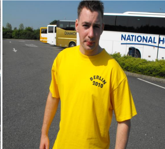
WAD Football Trip to Berlin (Germany 2010)