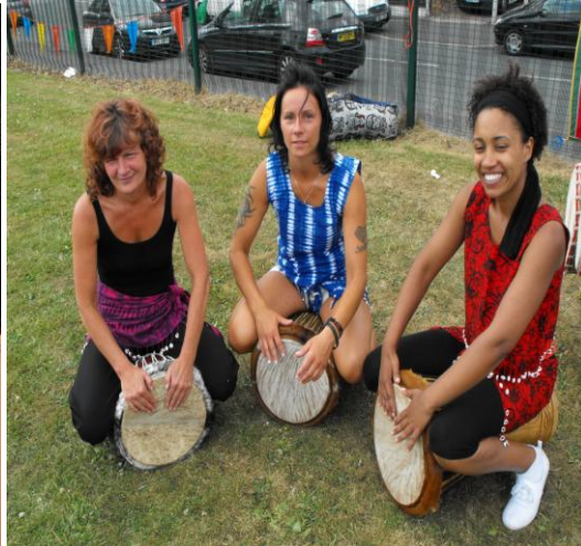
WAD Cultural event (Manchester 2013)