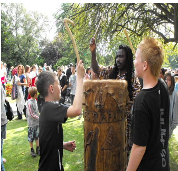
WAD cultural exchange & BME event workshop