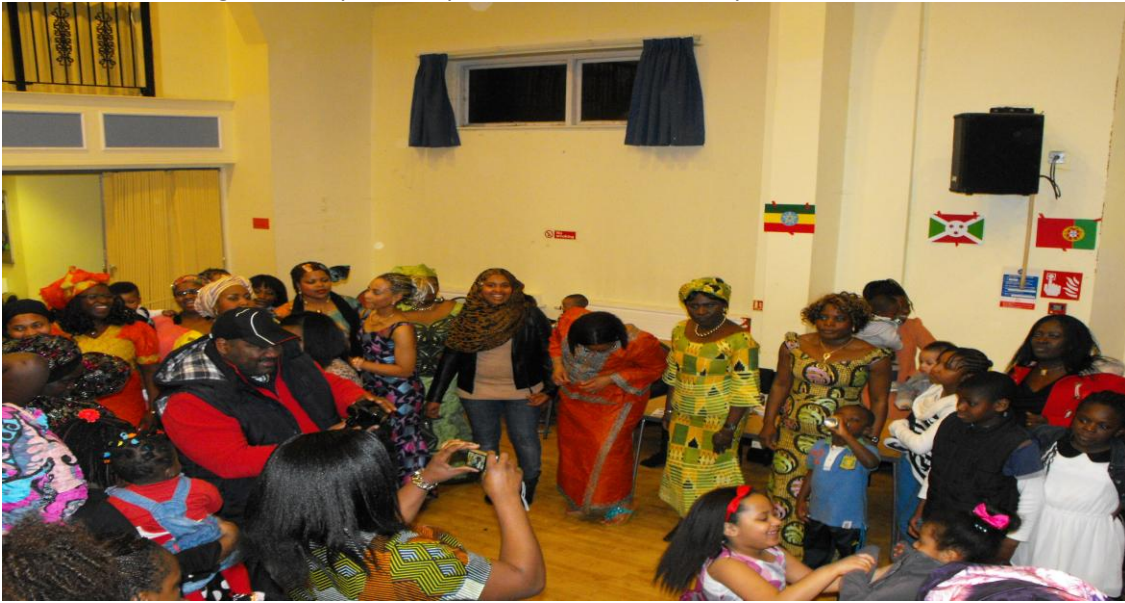
WAD Women International Day event Tameside Manchester (2013)