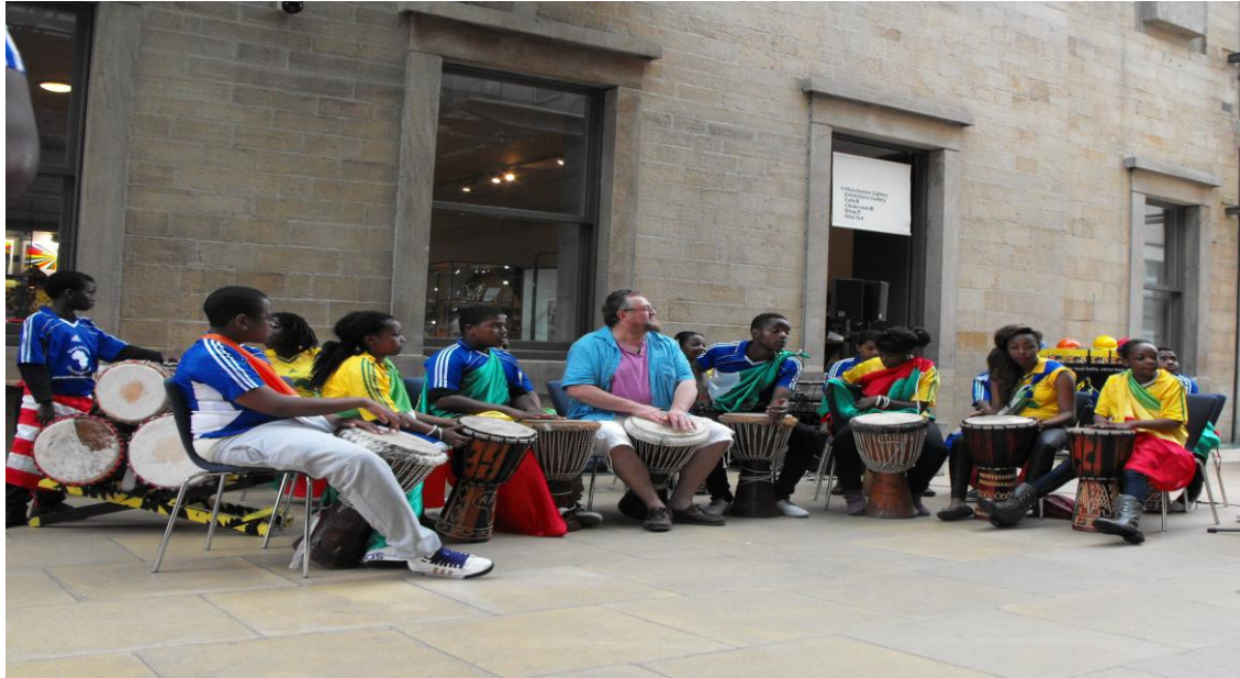
Manchester Museum WAD cultural performance (2010)