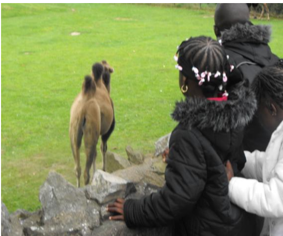
WAD Trip to Chester Zoo 2008