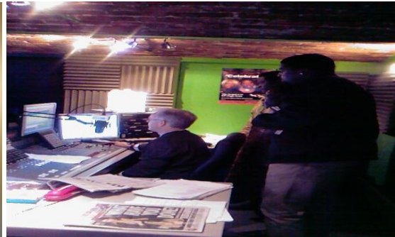
WAD visited Tameside Radio Station in (2008)