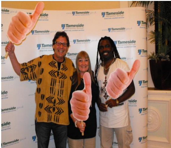
WAD Funding event (Tameside 2011)

In doing so this doesn't restrict us to a particular community but have it such that we can grow to help set up multiple points in other communities just like the McDonalds franchise scheme; All W.A.D. charters following exactly the same constitution, rules and regulations and modus-operand regardless of where the charter point is, in order to provide exactly the same type of service in that community