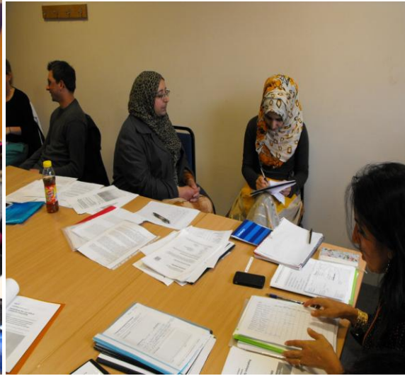
WAD English language ESOL class Manchester 2013 WAD Community interpreting training course 2013